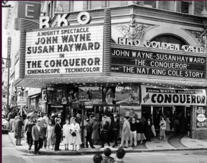
Capitol Theatre, Rome, NY, Circa 1940