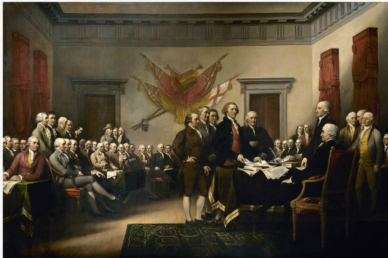
(signing the Declaration of Independence)

After driving the French out of North America in 1763, the British imposed a series of new taxes while rejecting the American argument that taxes required representation in Parliament. Tax resistance, especially the Boston Tea Party of 1773, led to punishment by Parliament. All 13 colonies united in a Congress that led to armed conflict in April 1775. On July 4, 1776, the Congress adopted the Declaration of Independence drafted by Thomas Jefferson, proclaimed that all men are created equal, and founded a new nation, the United States of America. Between 1775 and 1782 the Americans fought the British army with support from France and military leadership by General George Washington . The peace treaty of 1783 in Paris established the new nation. In 1787 the Constitution was introduced.