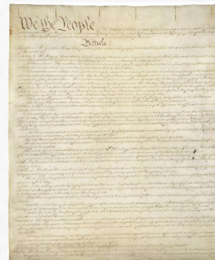
(The American Constitution)

From occup invade North for the acquir later b Nevad