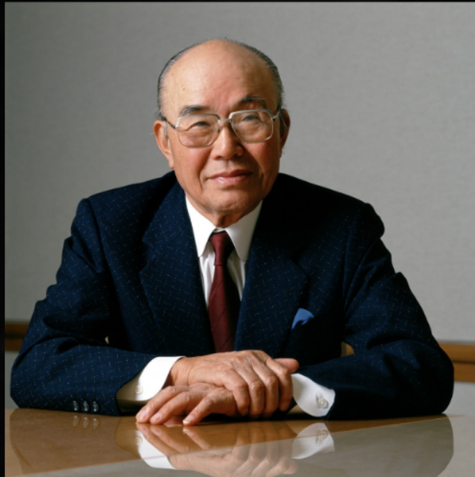
Soichiro Honda - Founder