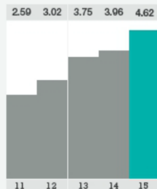
Diluted EPS from continuing operations in dollars