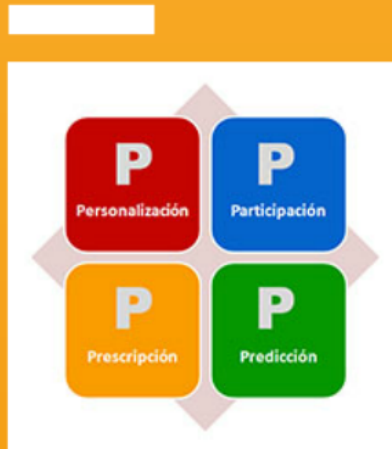
MARKETING SESSION 1