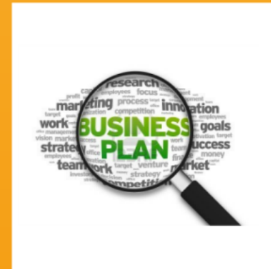
BUSINESS PLAN SESSION 3