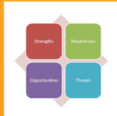
SWOT ANALYSIS SESSION 2