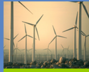
Low Carbon Energy