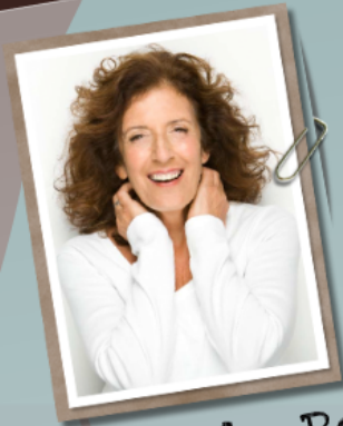
Founder of The Body Shop Anita Roddick 1942-2007