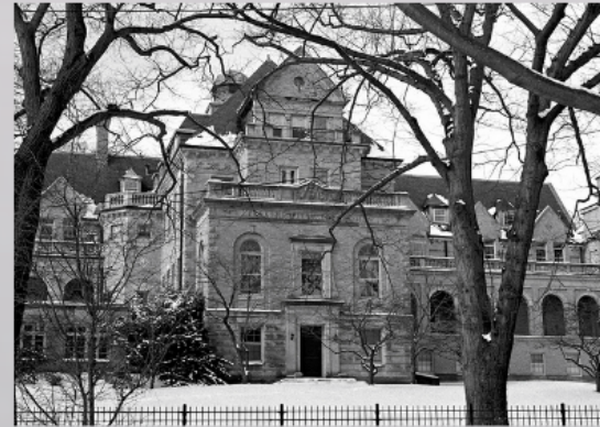
Free Hospital for Women