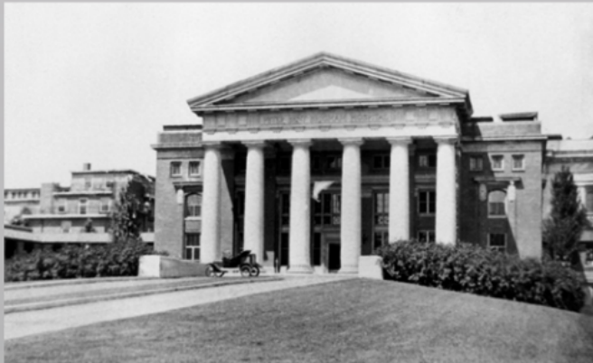
Peter Bent Brigham Hospital