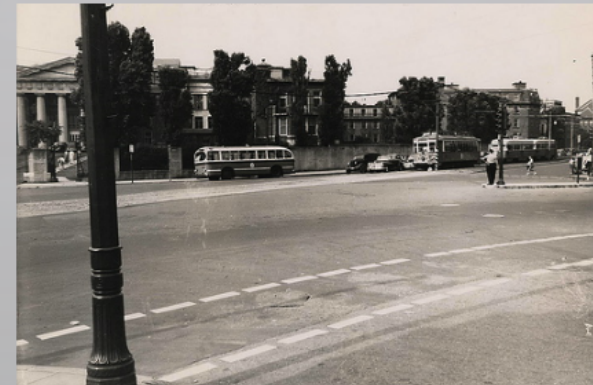
Robert B. Brigham Hospital