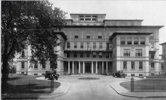
Boston Lying-in Hospital