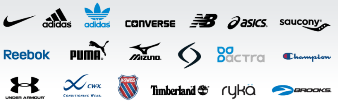
Market Share as a Percentage