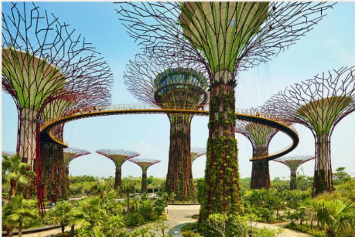
Gardens By the Bay