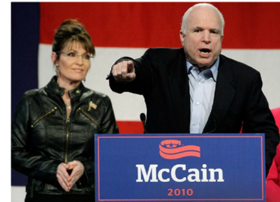
Arizona Senator, John S. McCain and his running mate, Alaska Governor, Sarah Palin.