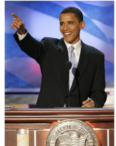
Obama at the 2004 DNC Keynote Address