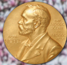
NOBEL PEACE PRIZE RECIPIENT 2009