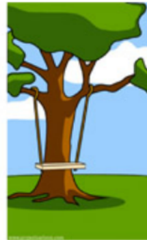
How the project leader understood it.