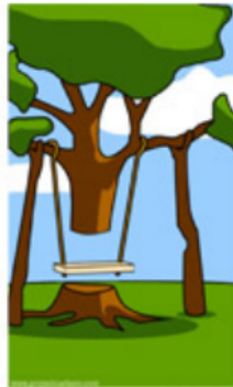
How the analyst designed it.