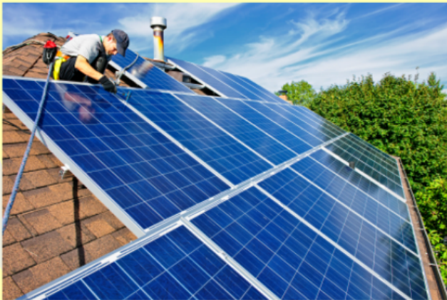
Solar panels, which can be installed anywhere, as long as you often have sun in your forecast