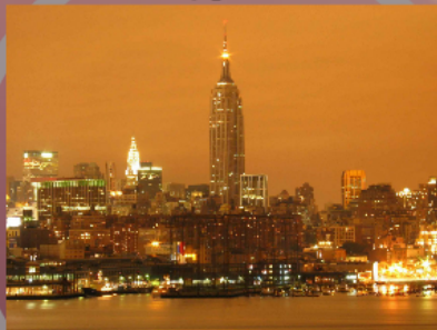
This time exposure photo of New York City at night shows skyglow, one form of light pollution.