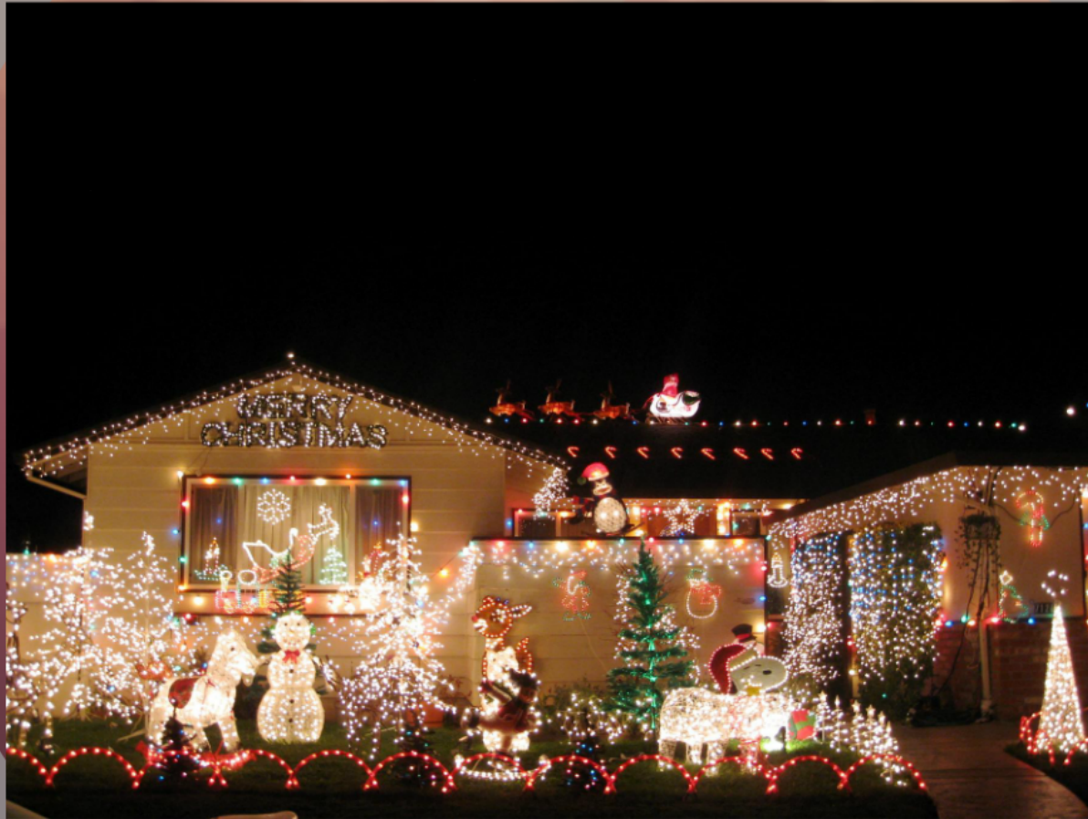
Christmas lights in California.