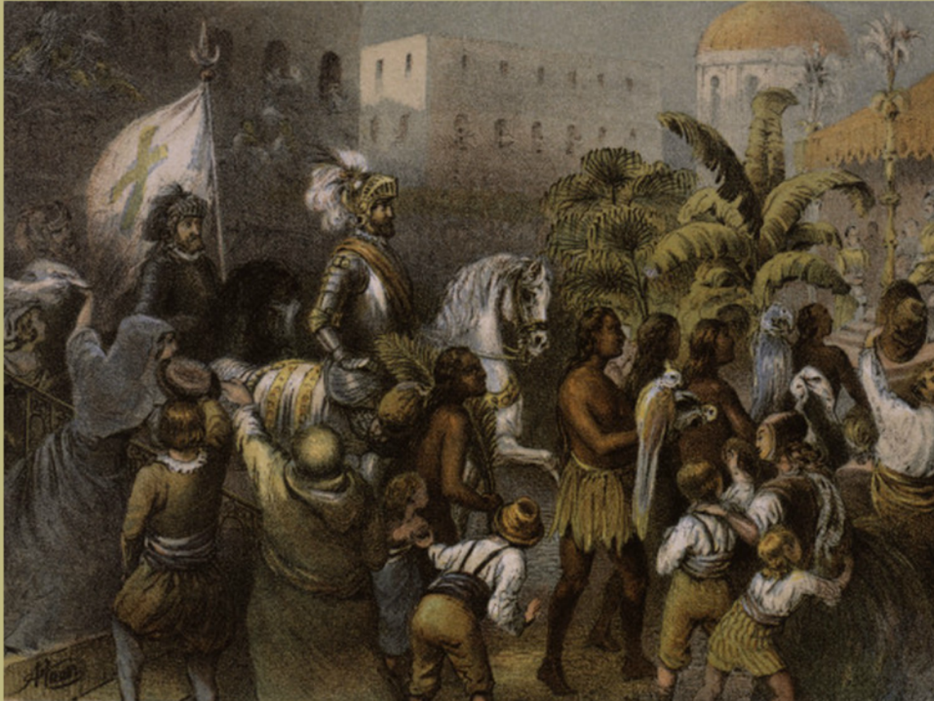
Columbus returns to Spain with enslaved natives and goods