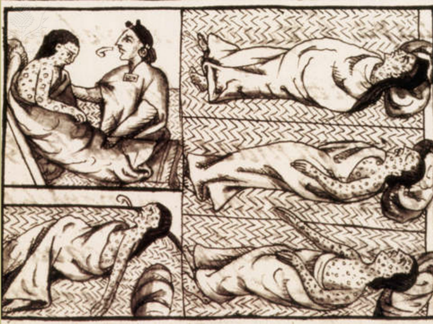
Aztecs dying from smallpox contracted from Spanish explorer Hernan Cortez's arrival