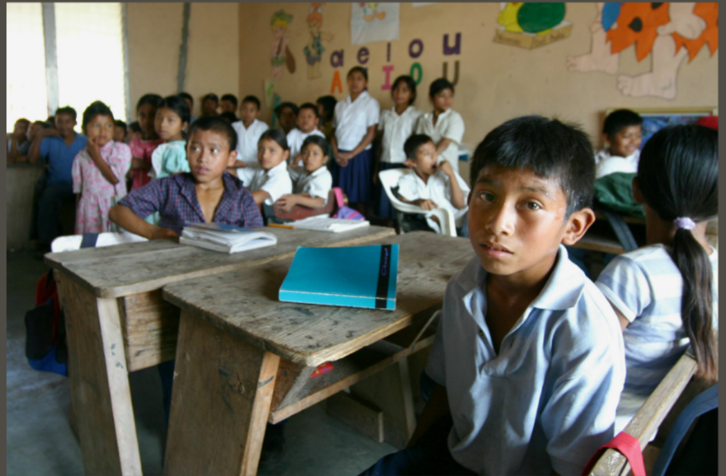
[Elementary classroom in Mexico]