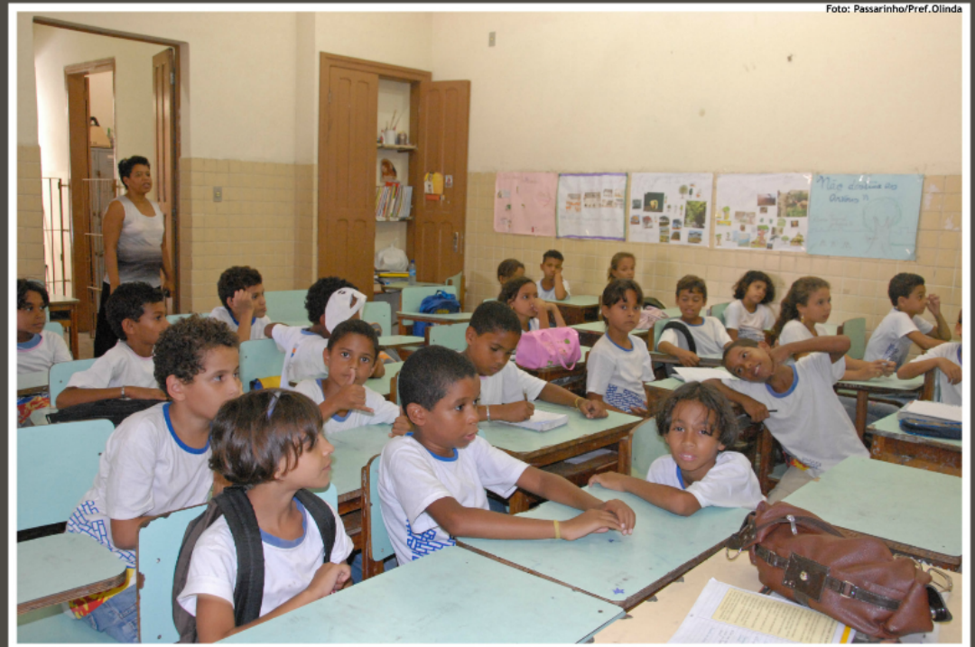
[Brazilian school children]