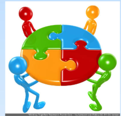
LINKAGE OF PEOPLE