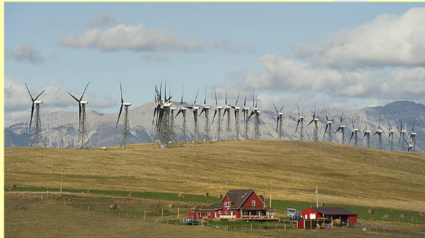
A wind farm, located on relatively flat ground, where there is a lot of wind present