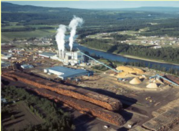
A biomass energy plant, located near a forest, a river, and roads