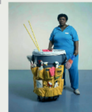
Queenie II (1988)