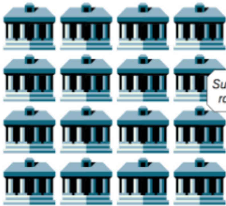
Banks on panel

The London interbank offered rate is based on what banks say they pay to borrow from each other.