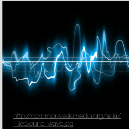
Another sound wave