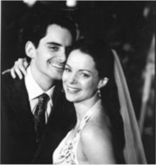
Brad Paisley and Kimberly Williams- Paisley