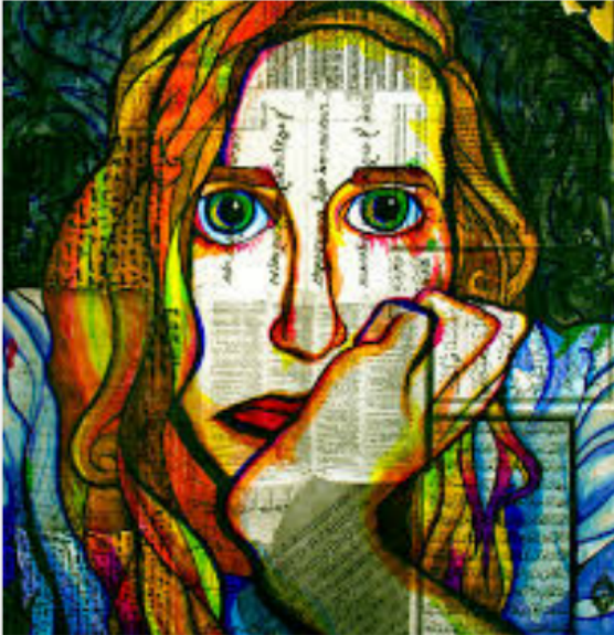
Moral Dilemma by DreamsOfDownfall Watch