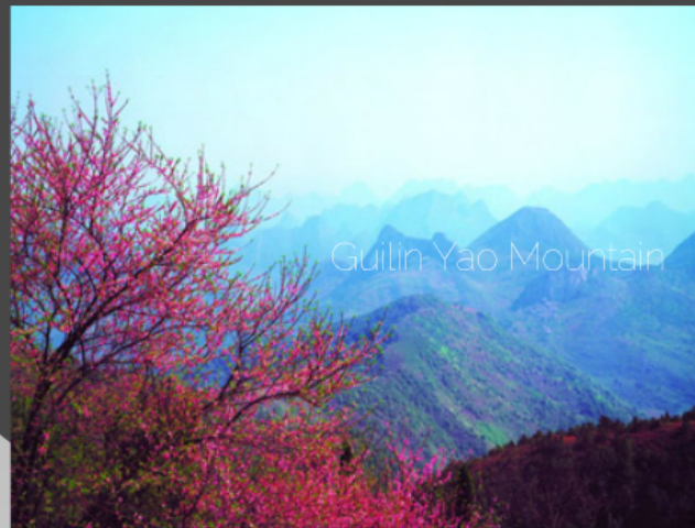
Guilin Yao Mountain

What are significant, ancient buildings that have brought ancient Chinese architecture to life?