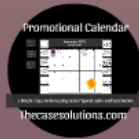
Brandmusele's Message to Dealers