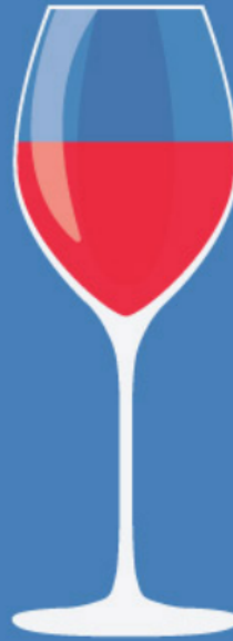
Rosé or spicy red wine