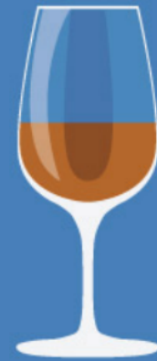
Fortified sweet wine