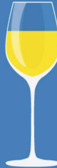
Light-bodied white wine