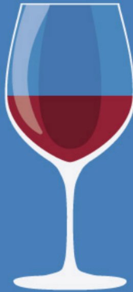
Light-bodied red wine