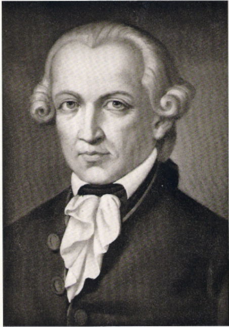
IMMANUEL KANT From a painting