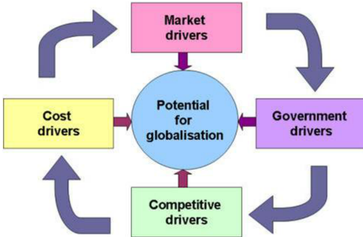
Fig.1 Yip's Globalisation Drivers (1992)