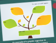
An example of a graphic organizer to help with organization and support of a central idea.

Organizing writing to support a central idea. Having organized writing was one of the central ideas taught throughout this course. For example, each essay required an outline. The requirement of an outline ensured that each essay was organized, and the peer review of the outlines ensured that the central idea was supported. Competency 2 is even evident in the final project as well. The final project was introduced with a competency brain storming worksheet to help ensure the writing was well organized and supported a central idea.