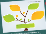
An example of a graphic organizer to help with organization and support of central idea.

Organize writing to support a central idea. Having organized writing was one of the central ideas taught throughout this course. For example, each essay required an outline. The requirement of an outline ensured that each essay was organized, and the peer review of the outlines ensured that the central ideas were supported. Competency 2 is even evident up till the end of this class. For instance, the final project was introduced with a competency brain storming worksheet to help ensure the writing written was organized and supported a central idea.