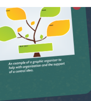
An example of a graphic organizer to help with organization and the support of a central idea.

Competency 2 Use appropriate research to writing Competency 2 was met essentially every day. Students used the graphic organizer to organize their research and use it to support their main idea. They also used the graphic organizer to organize their research and use it to support their main idea. They also used the graphic organizer to organize their research and use it to support their main idea.