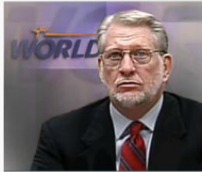
Bernard Ebbers (Chief Executive Officer)