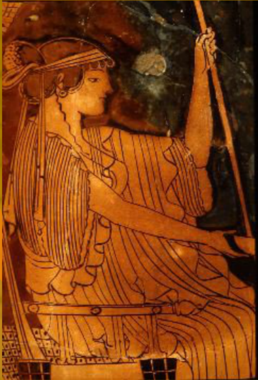
Museum of Art, RISD, Providence, RI Attic red figure lekythos c. 500-475 B.C.