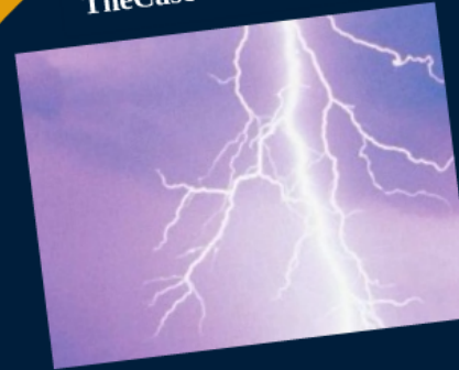
The action of lightning!