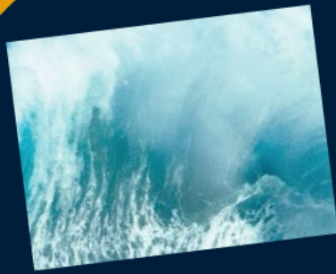
The flow of running water.