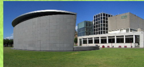
The Van Gogh Museum

built in the 17th century for Louis Napoleon and later, the dutch royal house. A place I would suggest you go if you ever visit Amsterdam