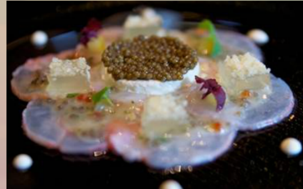
Langostinos with impérial cavier