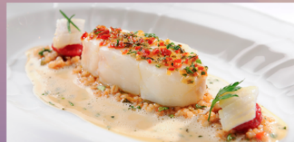
Fried bass with nut risotto, cider sauce & apple