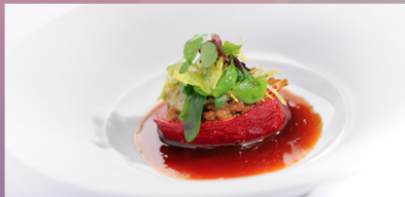
Saddle of roe deer with hazelnut, chestnut & savoy cabbage