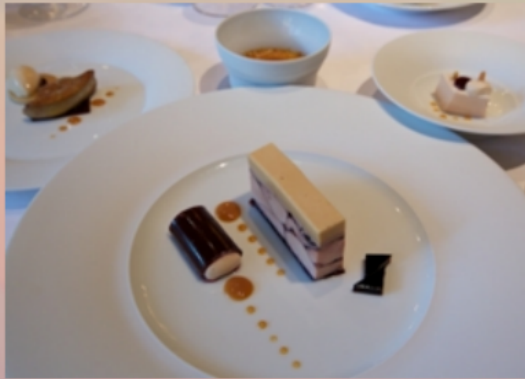
Goose foie gras with salty caramel & port