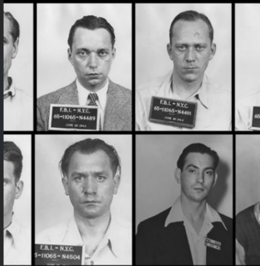
World War II Spies

ALONG WITH ITS MASSIVE FIELD CAMPAIGNS, WORLD WAR II ALSO PLAYED HOST TO AN UNDERGROUND BRAND OF WARFARE THAT INCLUDED ESPIONAGE, SABOTAGE, DISINFORMATION AND SPECIAL OPERATIONS BEHIND ENEMY LINES. THESE GLOAK-AND-DAGGER TACTICS RESULTED IN SOME OF THE MOST INGENUOUS AND UNCONVENTIONAL MISSIONS OF THE WAR, AND PLAYED A VITAL ROLE IN THE OUTCOME OF SEVERAL MAJOR BATTLES. FROM THE SPY THAT NEVER WAS TO A BAND OF NAZI IMPOSTORS, LEARN THE STORIES BEHIND FIVE OF THE BOLDEST AND MOST BIZARRE SPECIAL OPERATIONS CARRIED OUT DURING WORLD WAR II.