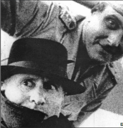
Benito Mussolini and Otto Skorzeny shortly after Mussolini's rescue

THE MISSION CAME IN THE WAKE OF THE ALLIED INVASION OF ITALY, WHICH HAD RESULTED IN THE FASCIST DICTATOR BEING EXPELLED FROM OFFICE AND ARRESTED BY THE KING OF ITALY. CONCERNED THAT MUSSOLINI WAS CRUCIAL TO KEEPING ITALY IN THE WAR, ADOLF HITLER ORDERED WAFFEN SS OFFICER OTTO SKORZENY TO FREE "IL DUCE" BEFORE HE COULD BE HANDED OVER TO THE ALLIES AS PART OF A PEACE DEAL. AFTER SEVERAL FALSE STARTS AND DEAD ENDS, SKORZENY AND HIS TEAM TRACKED MUSSOLINI TO THE HOTEL CAMPO IMPERATORE, A SKI RESORT SITUATED ON A REMOTE MOUNTAINTOP IN THE APENNINE RANGE.