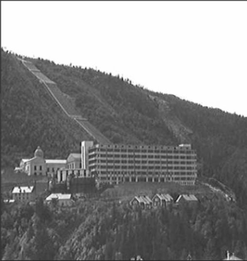
The Norsk Hydro Vemork plant

AT THE TIME, THE NAZI-CONTROLLED SITE WAS THE WORLD'S ONLY SIGNIFICANT PRODUCER OF HEAVY WATER-A SUBSTANCE CRUCIAL TO THE DEVELOPMENT OF ATOMIC WEAPONS. THE PLANT HAD ALREADY ALLOWED THE GERMANS TO MAKE PROGRESS IN THEIR ATOMIC RESEARCH, AND WINSTON CHURCHILL AND THE ALLIES WERE DESPERATE TO DENY THE NAZIS ANY CHANCE AT DEVELOPING AN ATOM BOMB.