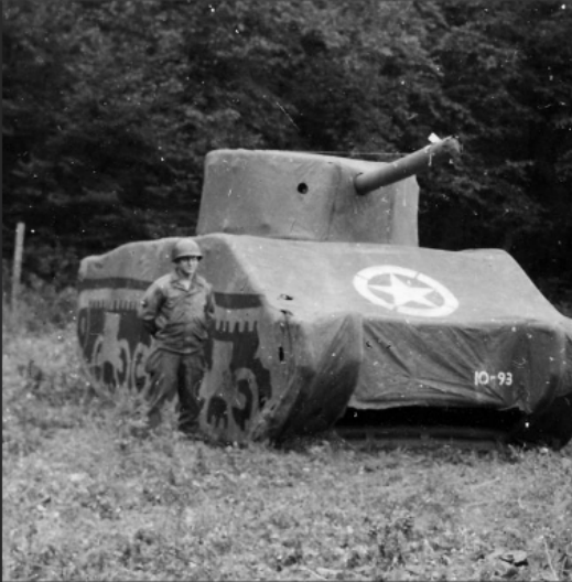
Dummy Allied tank

TO HELP SELL THE CON, THE ALLIES CREATED A FICTITIOUS INVASION FORCE KNOWN AS THE "FIRST U.S. ARMY GROUP" AND FED THE GERMANS PHONY INTELLIGENCE SUGGESTING THE PHANTOM ARMY WOULD LEAD A CHARGE ON THE PAS DE CALAIS. OPERATIVES USED INFLATABLE TANKS, WOODEN AIRPLANES AND DUMMY FUEL DEPOTS TO TRICK RECONNAISSANCE PILOTS INTO BELIEVING THAT THE FIRST U.S. ARMY GROUP WAS ASSEMBLED IN KENT, ENGLAND—THE MOST LIKELY STAGING GROUND FOR AN ATTACK ON THE PAS DE CALAIS. TO TOP IT ALL OFF, THEY EVEN PLACED THE MUCH-FEARED GENERAL GEORGE PATTON IN CHARGE OF THE FAKE ARMY TO LEND IT AN ADDITIONAL AIR OF AUTHENTICITY.