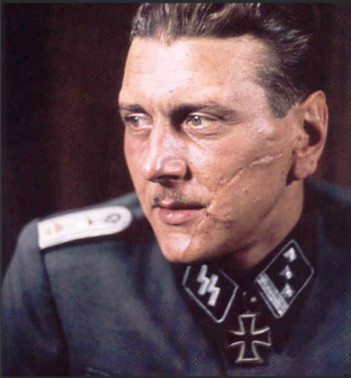
Otto Skorzeny in his jail cell, 1948.

AS PART OF "OPERATION GREIF," SKORZENY DISGUISED A SMALL COLLECTION OF ENGLISH-SPEAKING GERMANS IN CAPTURED AMERICAN UNIFORMS, PROVIDED THEM WITH FORGED U.S. ARMY DOCUMENTS AND SENT THEM ON AN UNDERCOVER MISSION BEHIND ENEMY LINES. IN A MATTER OF DAYS, THE SHAM SOLDIERS HAD SUCCESSFULLY DIRECTED TANK AND CONVOY TRAFFIC DOWN THE WRONG ROADS, DESTROYED AMMUNITION DUMPS, SWITCHED ROAD SIGNS AND DESTROYED TELEPHONE LINES—ALL RIGHT UNDER THE ALLIES' NOSES.