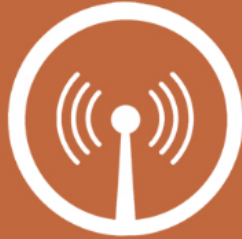
Data from sensors

Data that either does not have a pre-defined data model or is not organized in a pre-defined manner.