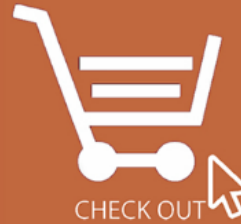
Number of clicks on a link