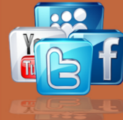
Social Media Feed