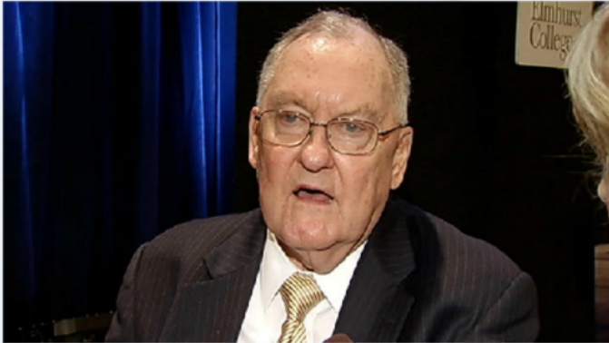
Republican Gov. Jim Thompson (1977-91)