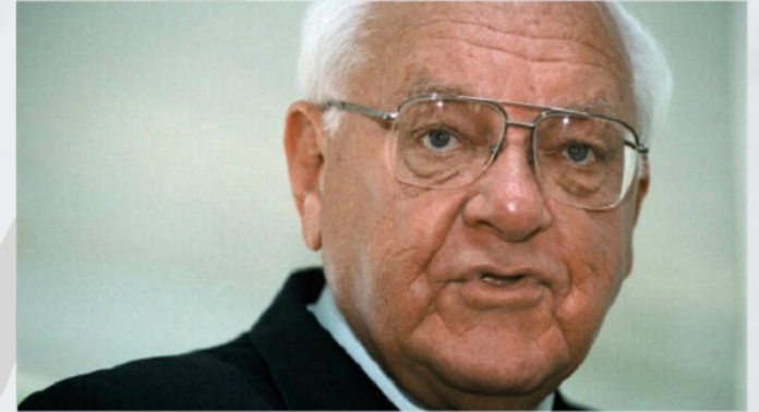
Republican Gov. George Ryan (1999-2003)