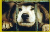
Animal cruelty is a huge problem in our world. Animals should be treated with respect and love.

• In the year 2000, it had been reported that over 7,600 greyhound puppies and 11,400 old greyhound dogs were killed