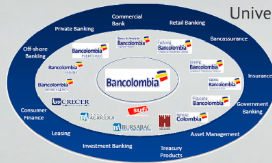
Universal Banking Concept