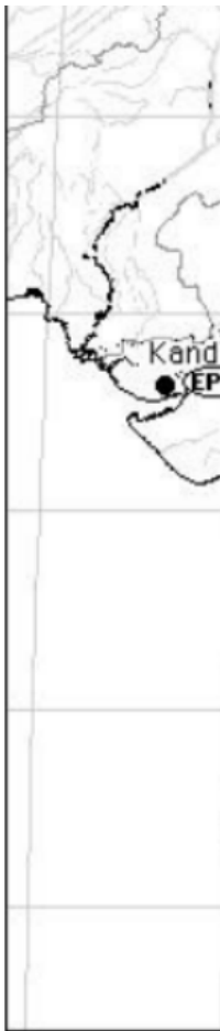
Figure 1 : The location of Kandamangalam EPZ