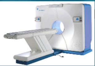
PET Scan Machine

a PET scan is a visual test allowing doctors to check for diseases; as well as see how your organs and tissues are working.